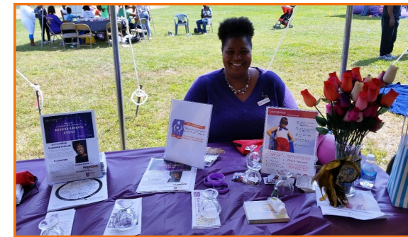
DCADV provided resources to the community at a variety of events, health fairs and trainings