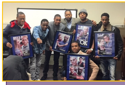
DE MEN organized a "Men Can Stop Rape" training at UD and DSU campuses focused on healthy masculinity

Workforce development efforts were expanded this year. In addition to offering Domestic Violence Specialist Certification to experienced advocates working in Delaware, DCADV has committed to teaching the University of Delaware's WOMS 408 Domestic Violence and Prevention Services course now each Spring Semester. Expansion came when DCADV hosted a Summer Prevention Practicum student as part of our partnership with UD on the Domestic Violence Prevention and Services Concentration and Minor program.