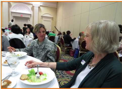
Participants were provided opportunities to share and learn from each other at DCADV's 20th Anniversary Institute