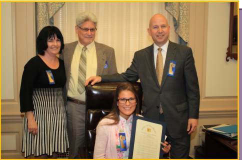
Governor Markell joined DCADV, Domestic Violence Task Force, Victims Rights Task Force, and Sexual Assault Network Delaware member to highlight Crime Victims Rights Week at our annual Advocacy Day at Leg Hall in Dover

Interviews with patients at partner clinics revealed: