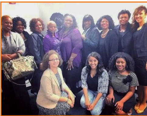
Members of DCADV's Women of Color Task Force participated in the Kim Congo show to promote the "Women Who Jam" fundraiser