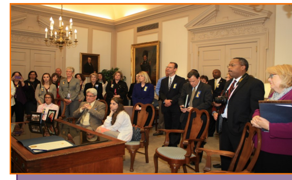
40+ advocates convened in Governor Markell's office for Advocacy Day and the Proclamation Signing of National Victims' Rights Week