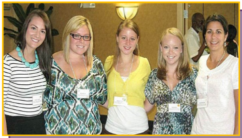
University of Delaware Domestic Violence Prevention and Services Concentration students