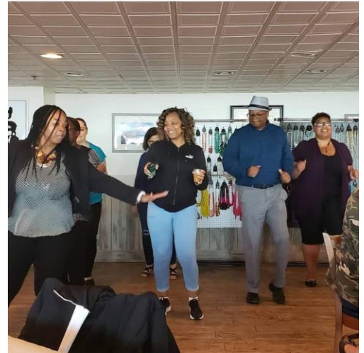
WOCTF's "Fun at Five" Event

The second day of the conference opened with a recognition of Delaware's Certified Domestic Violence Specialists (DVS). Currently, there are 41 certified DV Specialists who work in a variety of settings across our state, providing both intervention and prevention services to those affected by domestic violence. Delaware's certified DVS have demonstrated a continued commitment to education, improving services, and mentoring the next generation of advocates. We appreciate the passion and dedication of these individuals as they help Delawareans recognize the importance of safe and healthy relationships.