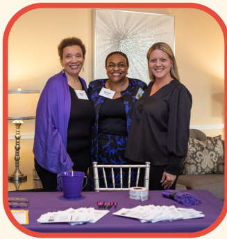
Task Force members at Purple Ribbon 2022!