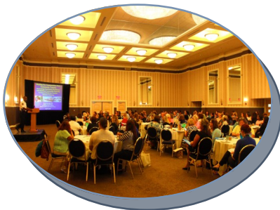
2015 Resilience on the Riverfront: Transforming Trauma

ADDRESSING OPPRESSION: DCADV continued to work with diverse partners to develop and deliver culturally-relevant and community-specific trainings, helping to “connect the dots” between violence and oppression. Many of these efforts were led by and lifted the voices of people most vulnerable to violence. Survivors with disabilities described experiences of intimate partner abuse; Trans men and women shared their health and safety needs; Black and Brown boys and young men exposed challenges of navigating masculinity and race while living in communities that face chronic adversity; and, survivors like Marissa Alexander, DCADV’s keynote speaker at our 18th Advocates’ Retreat, revealed how structural violence led to her prosecution and incarceration as a Black woman and mother defending herself against an abusive partner.