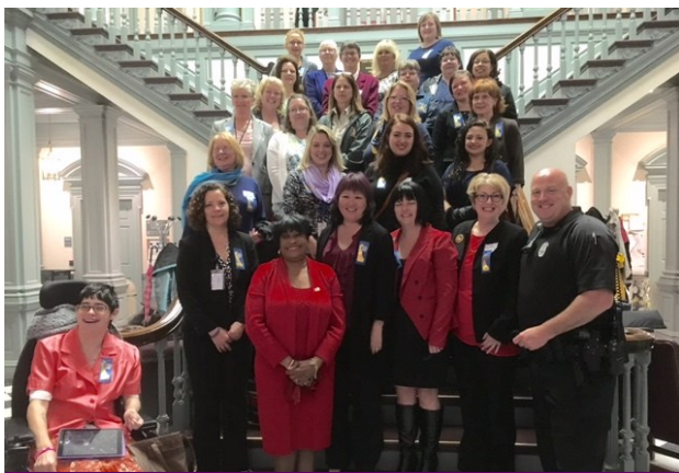
Advocacy Day, Legislative Hall

Funding this Great Cause – Advocacy within the General Assembly's Joint Finance Committee and Delaware's Congressional Delegation addressed the fact that lifesaving domestic violence services (emergency shelter, legal advocacy, advocacy/case management) are underfunded. As a result requests for service go unmet.