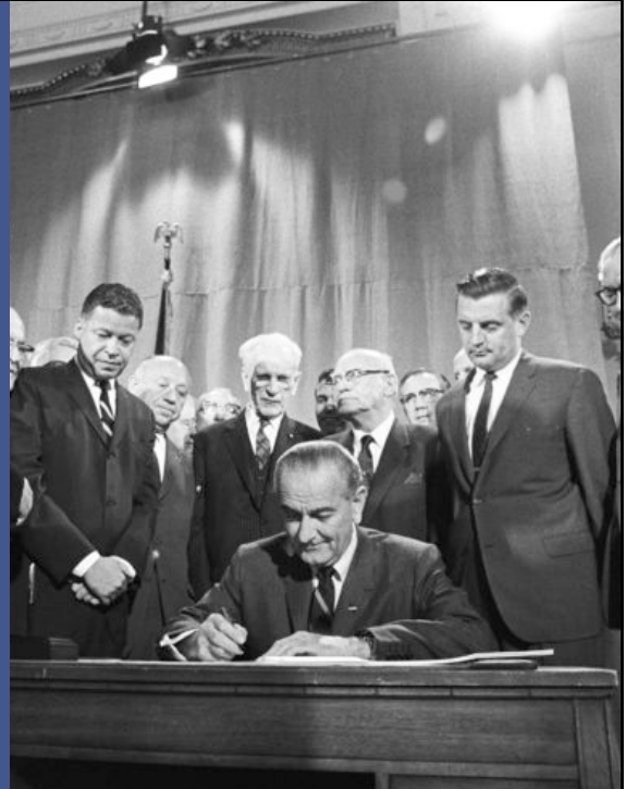
President Johnson signs Fair Housing Act on April 11, 1968